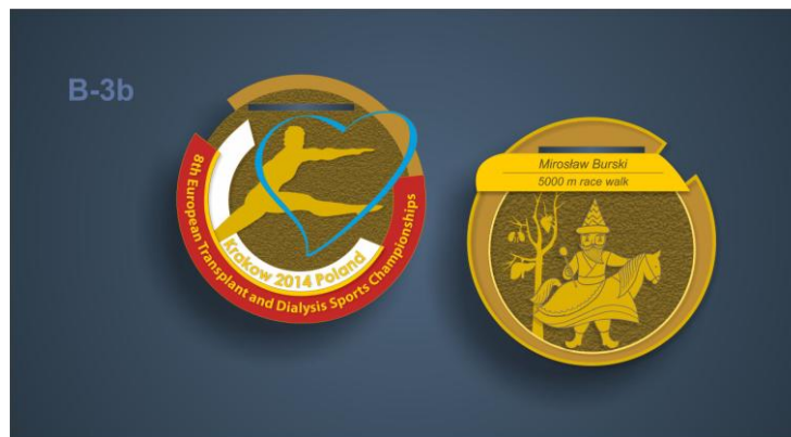
Presentation of the medal.